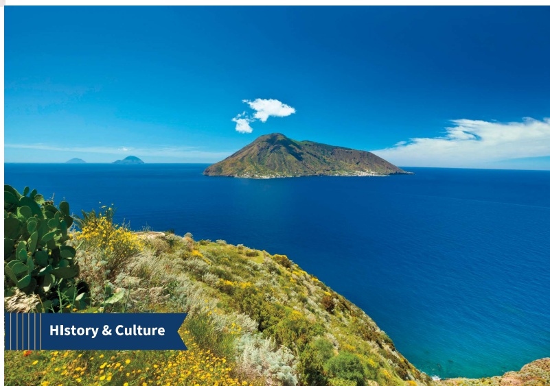
History & Culture