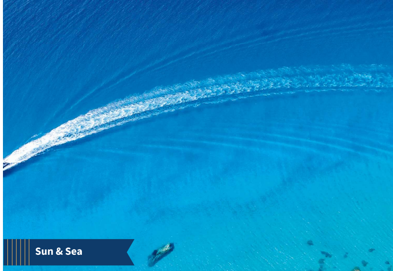
Sun & Sea