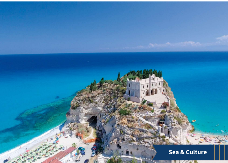
Sea & Culture